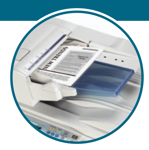
The highly reliable, single-pass document feeder is capable of scanning up to 75 images per minute.